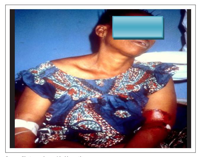
FIGURE 5: Ebola patient with haemorrhagic diathesis at transfusion and injection sites.